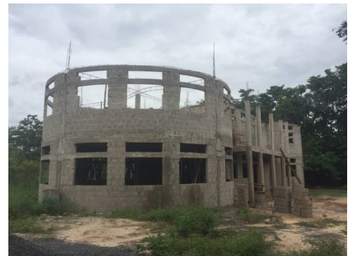
The new Administrative & Accommodation block at Makasutu

The building work continues at Makasutu and the end is now in sight. We hope to have it ready and functioning by early next year. We have had a number of setbacks which have delayed completion but we are now on the home straight. We hope it will become a resource for veterinary students from all over the world as well as helping the working animals of The Gambia and their owners.