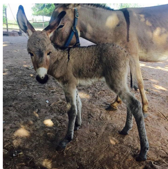
A recent grandbaby of an original project donkey called Easterton

Unfortunately due to the dreaded neurological disease claiming so many of our project donkeys we stopped seeking for donors as we found it too hard to tell them their donkey had died. One of the conditions that we made with the new guardians was that the first foal of every project donkey must return to GHDT for training and reallocating. We hadn't anticipated how productive our original donkeys would be when given good care and we are now on the third and fourth generation of donkeys. If your donkey died, you will be glad to know that your legacy lives on as is the case of grandbaby Easterton who was donated from Milngavie in Scotland.