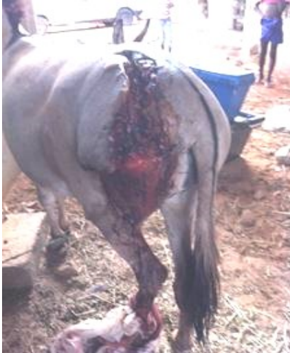
Lucky as she was found

It took a great deal of time to get the wound clean and they had doubts about whether the blood supply would be compromised, but they persevered and we are all delighted with the result. The police were wonderful and requested the driver to cover the veterinary costs. This little donkey was subsequently named Lucky by the staff!