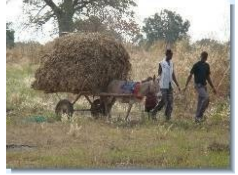
One cart of hay - £18