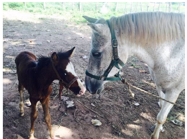
Little Smudge now, making progress and making a friend