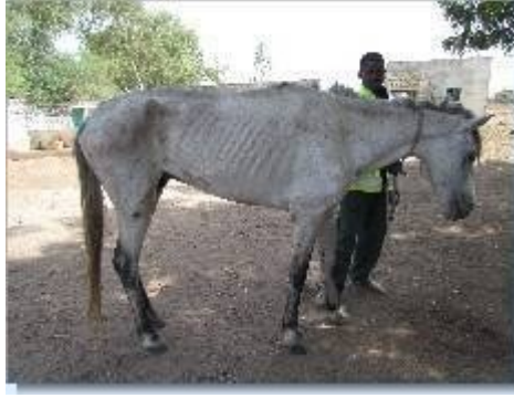
Trypanosomiasis Treatment Kit - £12.00