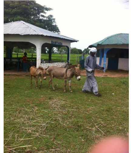
Lucky going home with her very grateful owner