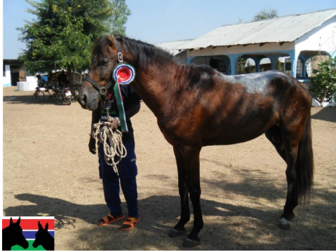
Phoenix, who was badly burnt in a stable fire is available to sponsor- £24

You can sponsor one of our horses or donkeys for one year at The Gambia Horses and Donkey Trust and in doing so you will be helping toward the running costs of our centre. Meaningful Gifts can be purchased for differing amounts, please visit our website pages on "How to Help".