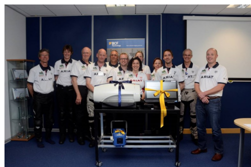
Pictured right, The Vets with Horsepower Team 2015 being presented with the X-ray machine