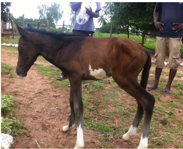
Smudge, very poorly at 2 days old