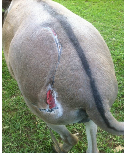
The wound healing well